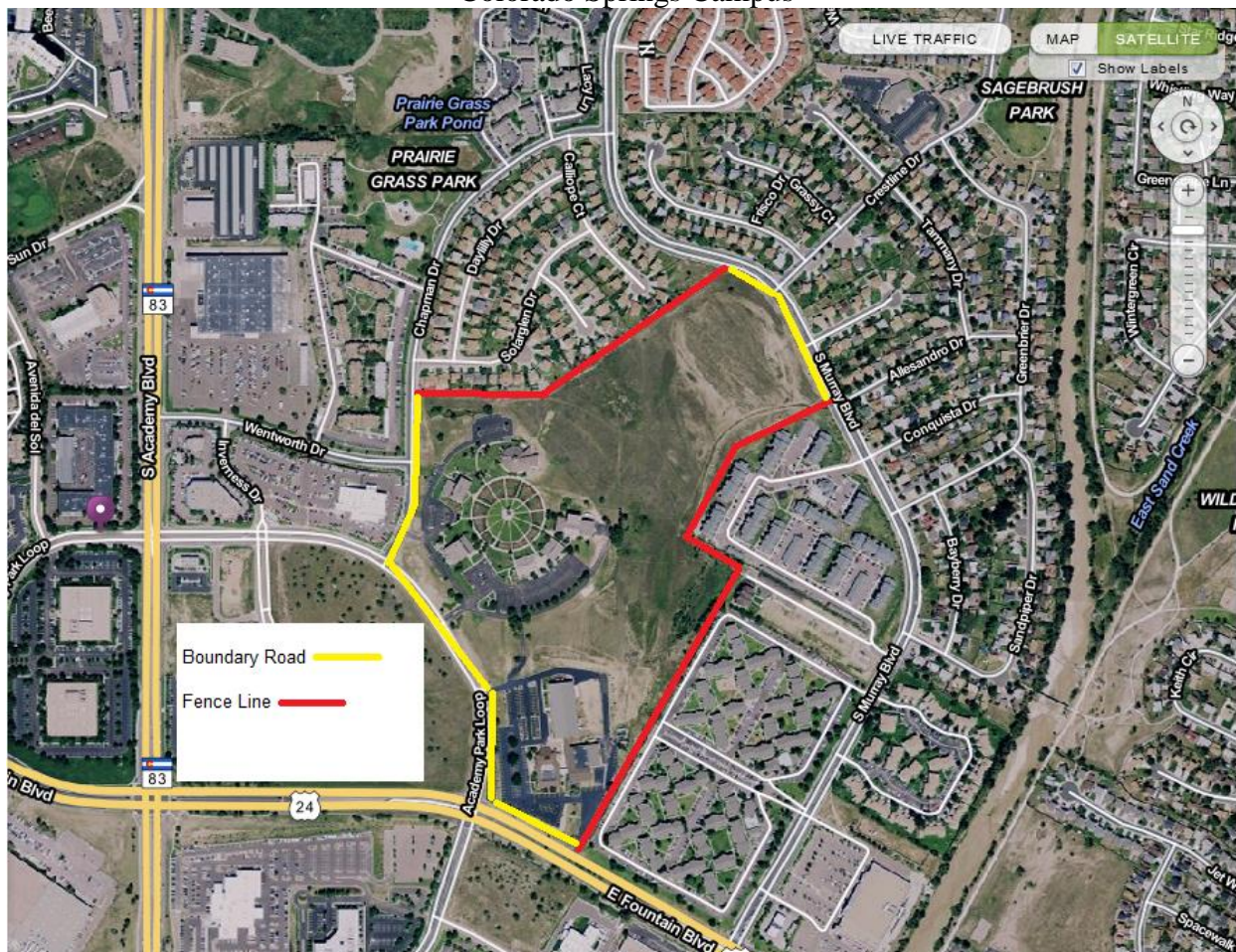
Colorado Springs Campus

Based on the definition above and the guidance provided in The Handbook for Campus Safety and Security Reporting, 2016 Edition, Nazarene Bible College has identified its Clery Geography to be within the boundaries drawn below: